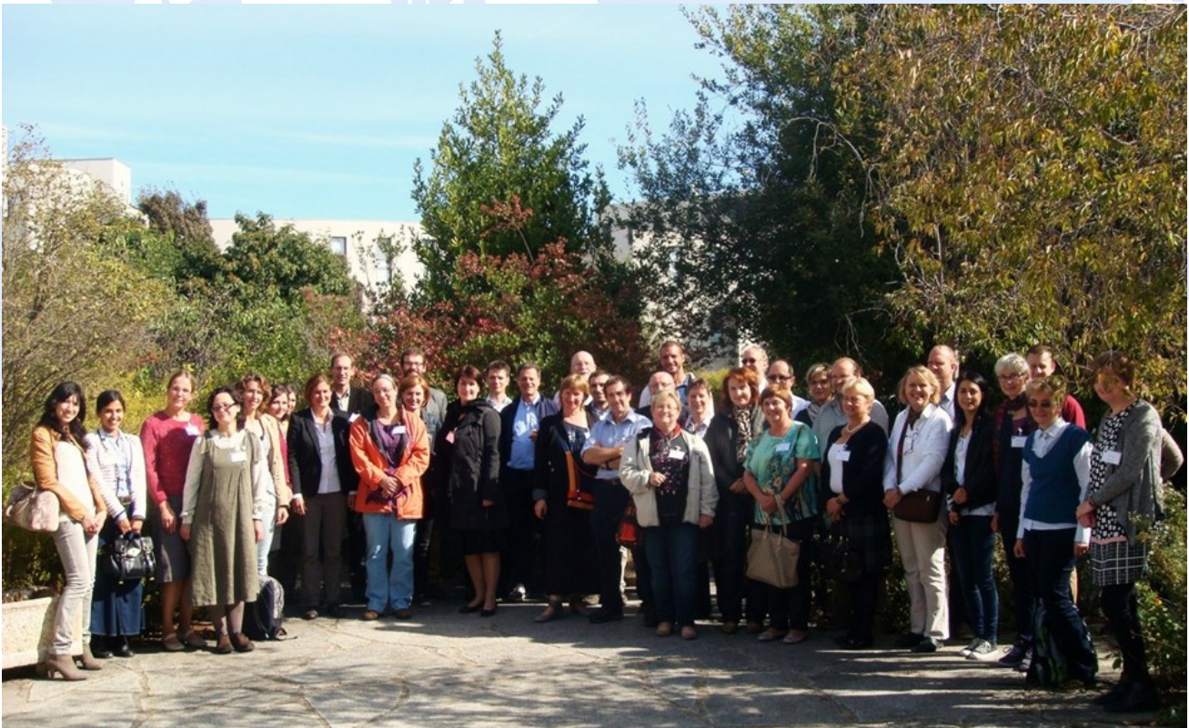
The 2014 workshop for EIA in France (Town of Lyon)

Concerning proficiency tests, workshops and training, a turnover of the diseases is planned. Once a year, proficiency tests for two distinct diseases (EIA, Glanders or CEM and Dourine) are organized and the workshops with all the NRLs are dedicated to the same diseases.